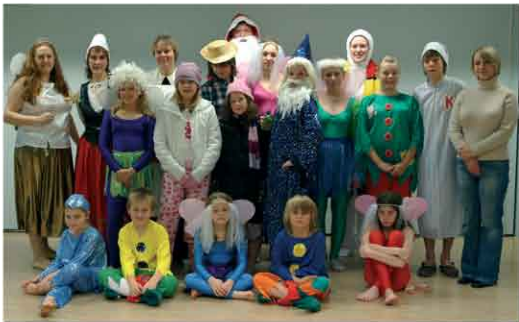
cast of The Magic Scarf

Sue: Nice to have Sue back again; she's been away too long.